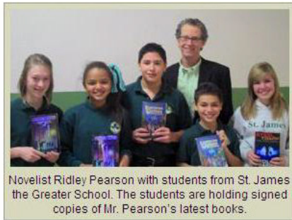
Novelist Ridley Pearson with students from St. James the Greater School. The students are holding signed copies of Mr. Pearson's latest books.

In preparation for his visit, St. James students read two Ridley Pearson novels for young adults – The Kingdom Keepers and Steel Trapp . Students discussed the content of these books with the author during a question and answer session. At the conclusion of the event, Mr. Pearson signed each child's book.