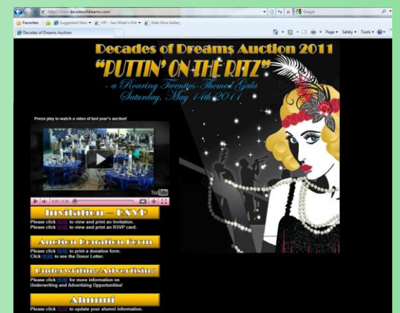
(Screen Shot of the Decades of Dreams Auction Website)

Click HERE to visit the Decades of Dreams website